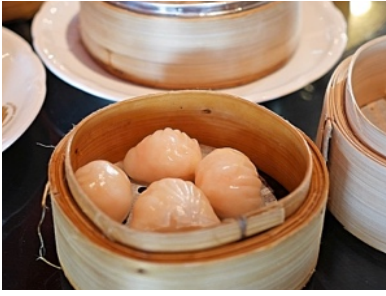
Ha kau: 蝦餃