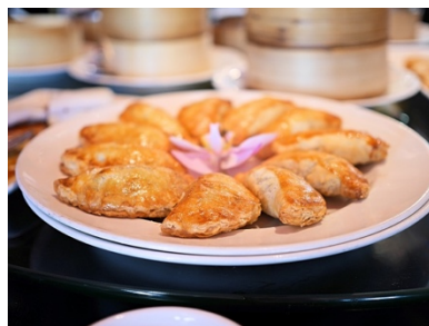
Cha siu sow: 叉燒酥