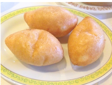
Haam sui kok: 鹹水角