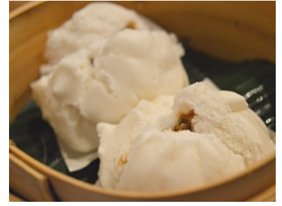
Cha siu bao: 叉燒包