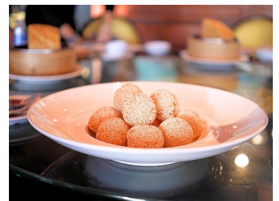
Lien jong tjien tjeui tjai: 煎堆