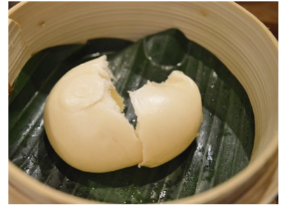
Lai wong bao: 奶皇包