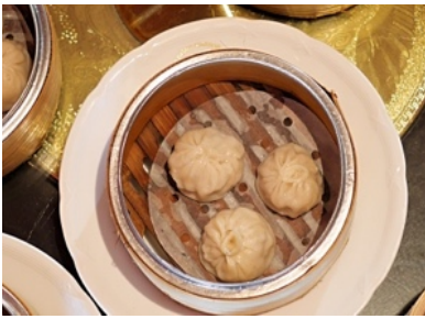
Siu long bao: 小籠包