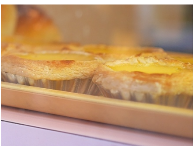
Taan thaat: 蛋撻