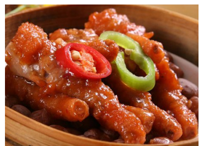
Fong saw: 豉汁鳳爪