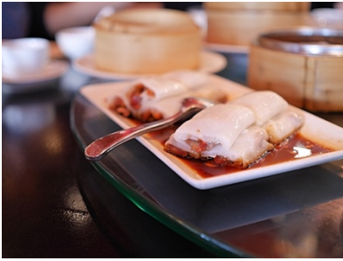
Cheung fan: 腸粉