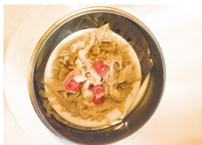
Ngau paak yip: 姜蔥牛柏葉