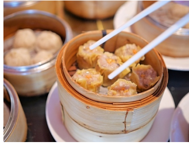
Siu mai: 燒賣