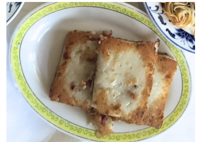
Lo bak ko: 蘿蔔糕